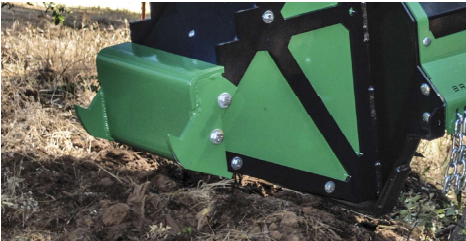
Heavy-Duty Bolt-On Thumb Saddle Reinforcement strengthens the thumb saddle for efficient debris handling.